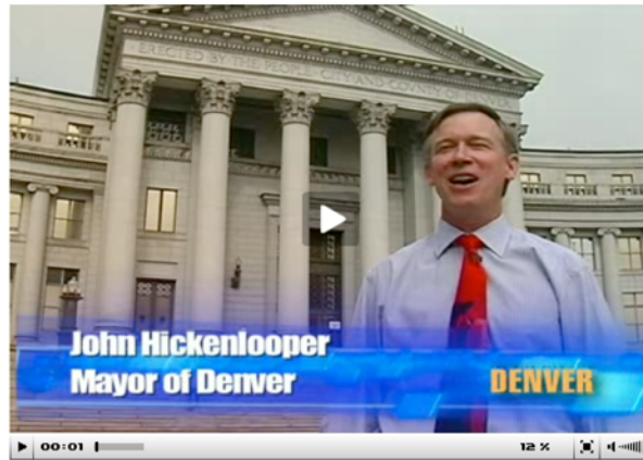
Come for the Convention, Stay for the Attractions and Scenery! [6:14m]: Download

For those that are staying in Colorado for a few extra days, check out this video for some great ideas for fun activities in and around the Rockies!